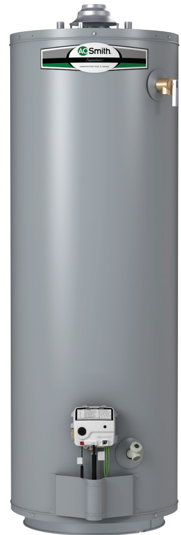
40-GALLON Signature™ 6-year PRODUCT SHOWN