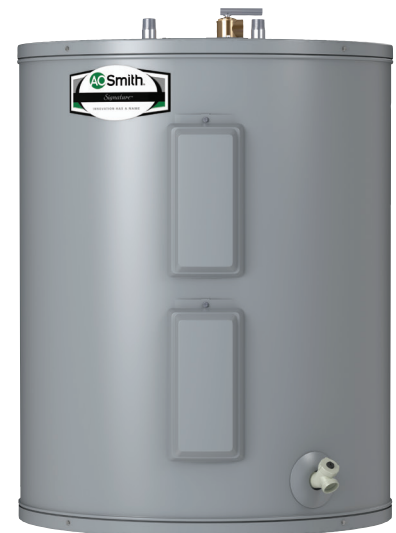
48-GALLON TOP CONNECT PRODUCT SHOWN